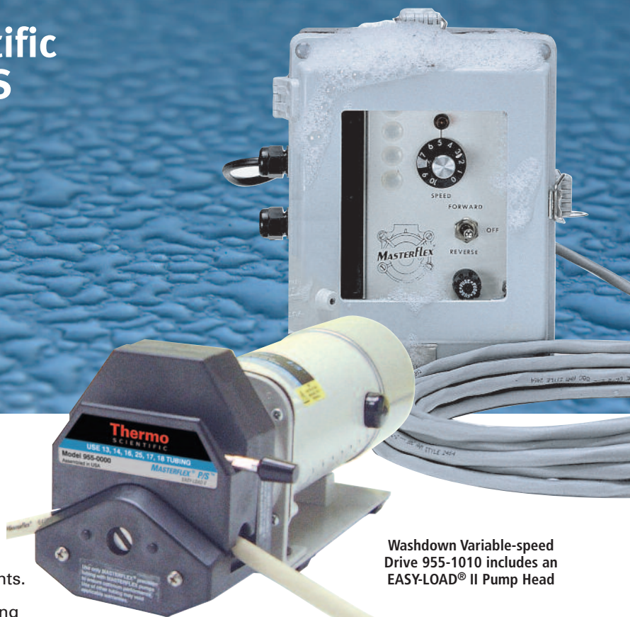
Washdown Variable-speed Drive 955-1010 includes an EASY-LOAD ® II Pump Head

Indianapolis • Chicago • San Juan www.hollandapt.com 800-800-8464