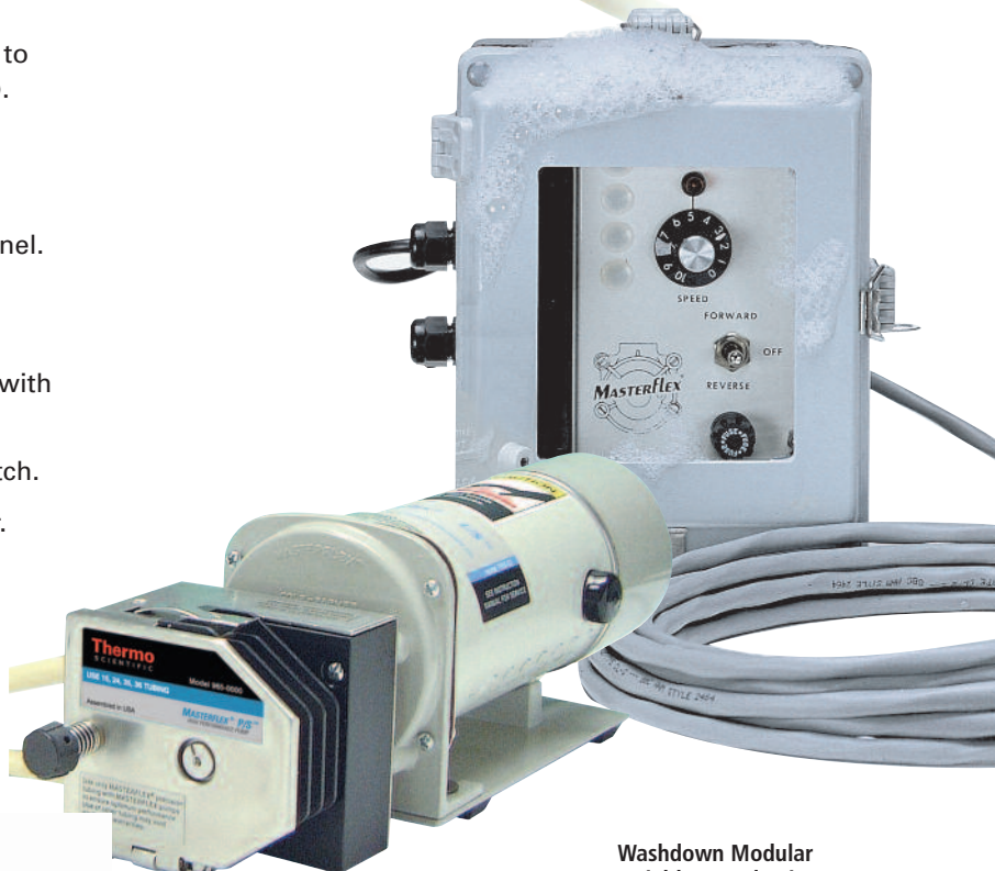
Washdown Modular Variable-speed Drive 965-1010 includes a High-Performance Pump Head