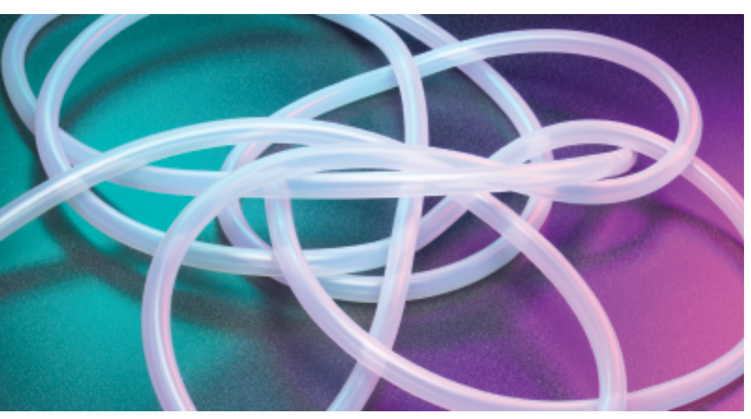
The excellent fatigue resistance properties of Sani-Tech® SIL-250 tubing make it an ideal tubing selection for peristaltic pump systems