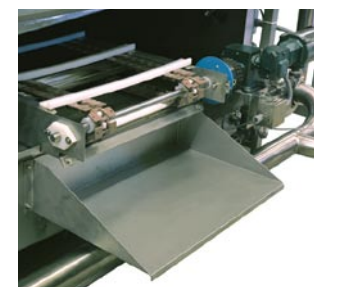
Conveyorized strainer removes large particles during pre-rinse.