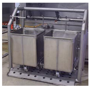
Custom Attachments increase flexibility – interchange vats and buggies.