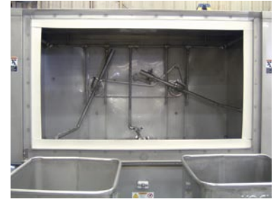
Synchronized rotating spray arms clean inside, outside & bottom of vats.