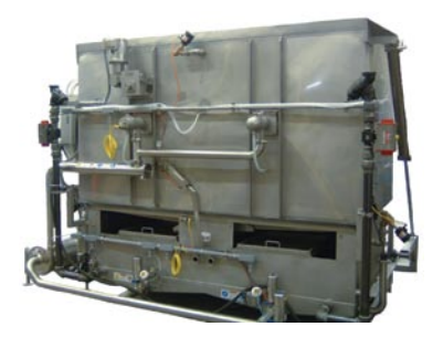
Tray and in-line strainers provide continuous filtering to remove soil. Reduce chemical use and prevent clogged nozzles.