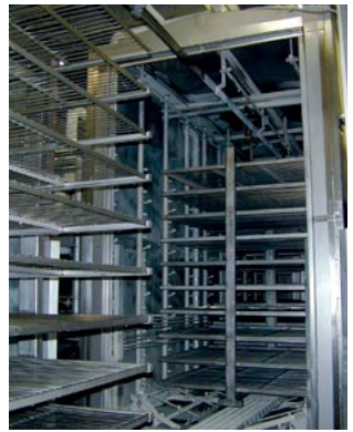
Overhead rail rack washer