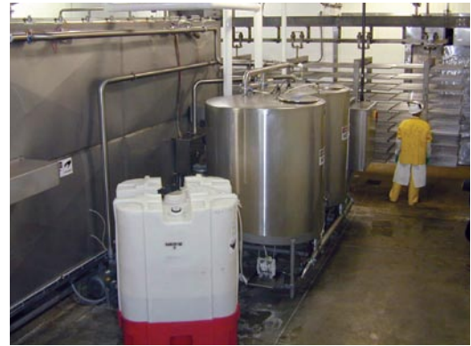
Reliable capacity paced with production flow. External CIP Solution Center conserves utilities.