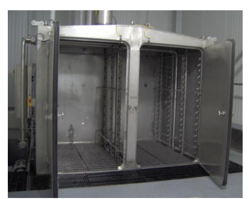
Floor truck washer