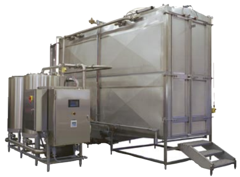
Remote Solution Center eliminates pit