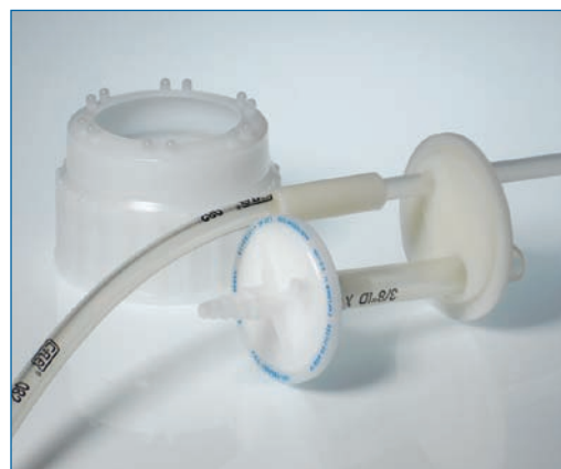
EZ Top ® Assembly and cap