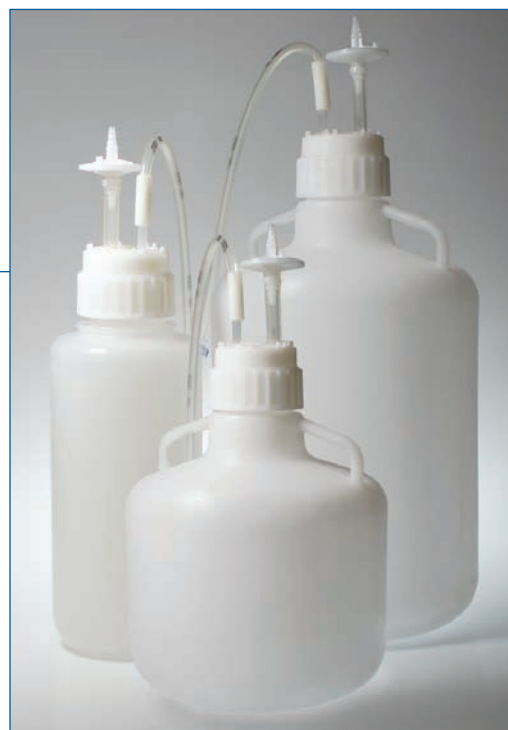
Bio-Simplex ™ Container Closure System featuring the EZ Top ® Assembly and cap.

The Bio-Simplex ™ Carboy Closure System features an EZ Top ® Closure Assembly made from C-Flex ® pharmaceutical grade resin and tubing, engineered to ensure an unobstructed fluid path, extremely low levels of extractables and a secure elastomeric seal against plastic, glass and metal surfaces. The EZ Top ® Assembly includes C-Flex ® tubing with standard plug end fittings, a Bio-Simplex ™ Flex Joint ™ , 0.2 µM vent filter and cap. Economically designed for single use, the system eliminates cleaning and contamination from repeated use. It is easily used with sterile connecting devices and thermal tubing sealers. We offer standard 2 and 3 port configurations to fit a wide variety of carboys in sizes from 5 to 20 Liters. Available as a complete packaged Bio-Simplex ™ Carboy Closure System (EZ Top ® Assembly, carboy and cap), either gamma irradiated or non-irradiated; or as individually packaged EZ Top ® Closure Assemblies. Custom designs, materials, sizes, packaging and other options—such as quick disconnect devices, Luer connections, heat-sealed ends or alternate carboy materials—are available on request.