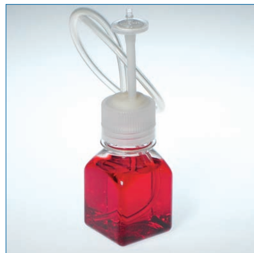
Single 60mL sampling bottle showing Bio-Simplex™ Closure Assembly with an EZ Top® container closure.