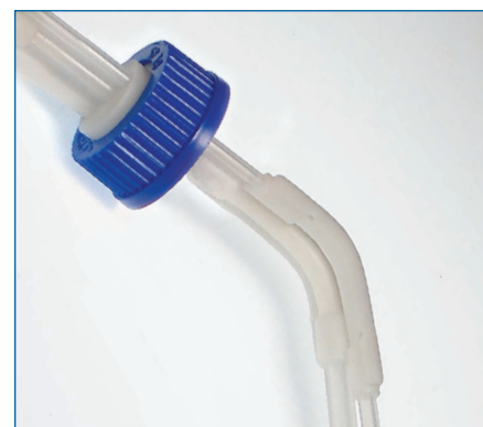
Spinner Flask Closure Assembly and cap. Cap colors may vary.