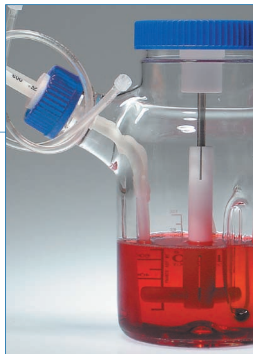
Bio-Simplex™ Spinner Flask Accessories feature the EZ Top® Assembly and cap. Glassware shown is representational of final usage and not included in assembly.

1 As noted in Pharmaceutical Technology Europe , January, 2006.