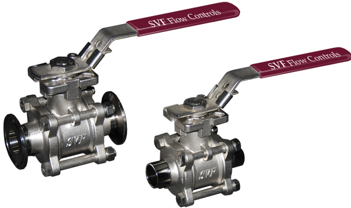
SB9 CleanTECH™ Ball Valve shown with TR ends (left) and ETO ends.