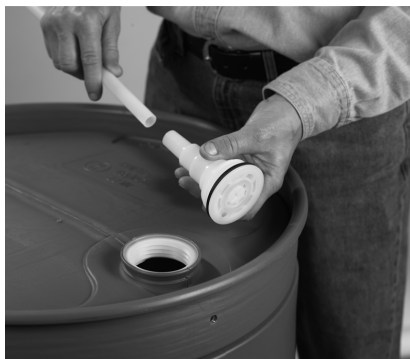
1. Fully press dip-tube into drum insert socket.

The DrumQuik® PRO drum insert assembly replaces one of the drum's bung plugs and is torqued and shipped as part of the drum package.