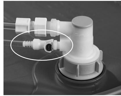
3. Vent port shown with Colder quick disconnect coupling.