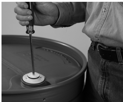
1. Turn shipping plug counterclockwise to remove. (Use a large, flat blade or #4 Phillips screwdriver.)

Remove the shipping plug from the drum insert assembly, then connect the DrumQuik PRO coupler, locking it into place.