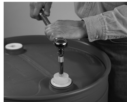
3. Torque insert with drum wrench or 1/2" drive torque wrench and a Colder torque socket tool (Colder PN 2408900).

Note: Contact factory for torque recommendations.