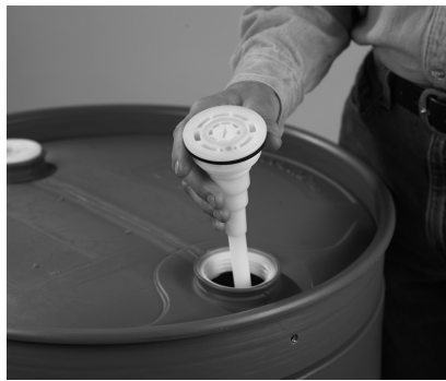
2. Place the drum insert assembly in drum.