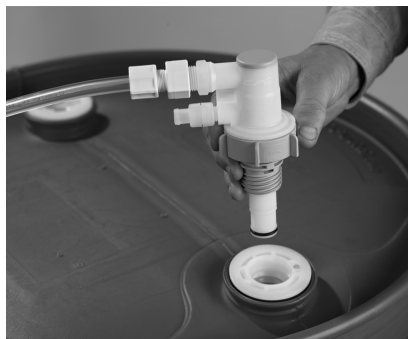
2. Insert coupler into drum insert assembly.