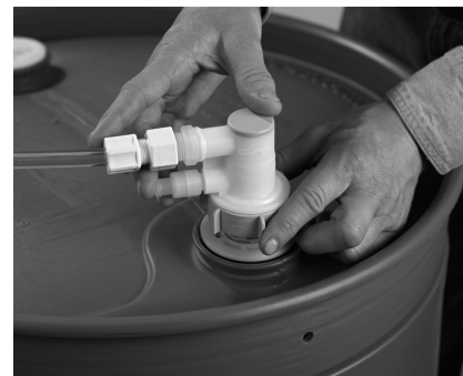
3. Turn the coupler locking ring clockwise until stop is reached (approximately 2 full turns); valve is opened during this process.