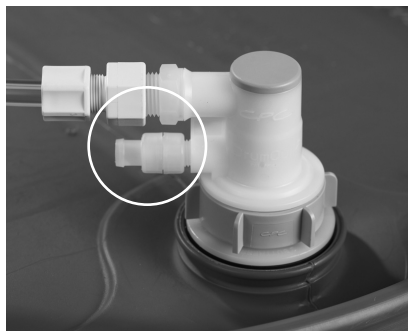
2. Vent port outfitted with Colder check valve.