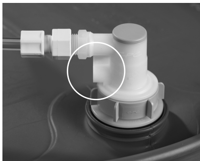
1. Vent port fully open.